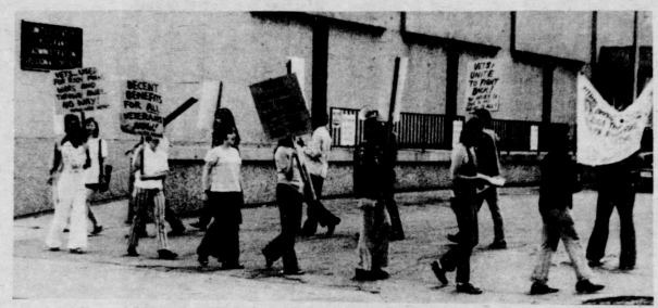
PICKET LINE IN DETROIT TO DEMAND DECENT BENEFITS FOR ALL VETERANS

to wait another two hours for it to be filled. stop other patients and VA workers. All of this is the result of cutbacks in staff -- one floor with 42 patients now has one nurse and one aide to take care of them. Trading the lives and health of can make one person do two people's work, they save money. And we're the ones who pay the price.