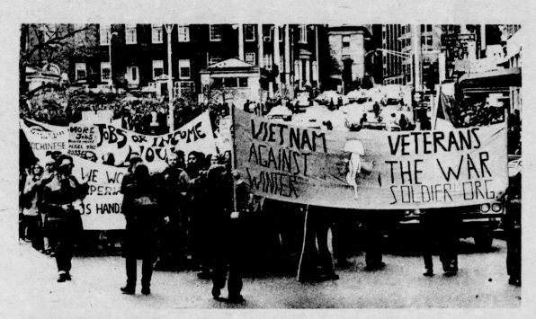
HUNDREDS DEMONSTRATE FOR VIETNAM VETERANS DAY IN BOSTON LAST MARCH

Veterans Day, November 11, has traditionally been a National holiday devoted to parades sponsored by a few national veterans groups that march once a year to show support for the US government's current policies. A major portion of these parades has gone to mobile exhibitions of marching troops and shiny new military hardware. The public response to these Veterans Day farces has been increasingly smaller attendance with, in many cases, only relatives and friends of the marchers on the sidelines.