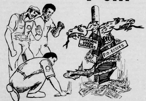
RANK AND FILE POSTAL WORKERS DIDN'T THINK TOO MUCH OF THE NATIONAL CONTRACT. IN SOME PLACES THEY FOUGHT BY PUBLICALLY BURNING THE CONTRACT.

Even though the contract was ratified, however the vote was obtained, the struggle is hardly over. The workers know that the bosses are going to continue to attack them, especially through "productivity" schemes like the Kokomo Plan (an automation plan to layoff more workers), increasing the number of deliveries for carriers and increasing the load of workers at the large bulk mail handling facilities by firing or forcing