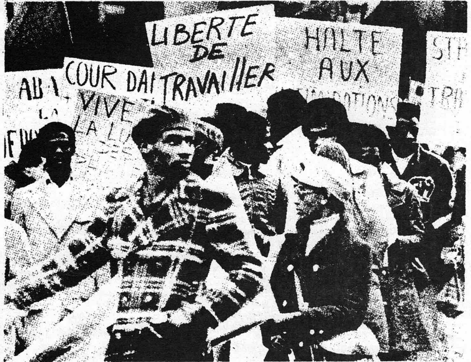
AGAINST DEPORTATIONS IN CANADA

because it is in Europe -- East and West, that the international apparatus of the Kremlin is the strongest. Stalinism -- whether the brutal police repression of the bureaucracy in the USSR or Eastern Europe or the more "subtle" betrayals of the Western Communist Parties under the name of "Euro-Communism" is the chief obstacle to the workers revolution -- in Europe, in the US and throughout the world. But it is in Europe where the workers must deal Stalinism its death blow.