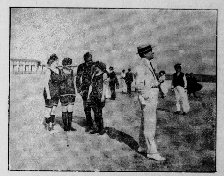
We Called Her the Woman Who Did Not Care But the Fool He Called Her His Lady Fair.

A PLAY THAT DEALS WITH THAT PHASE OF LIFE THAT HAS CAUSED MORE UNHAPPINESS AND THE DESTRUCTION OF MORE HOMES THAN ANY OTHER ONE THING THAT INFLUENCES MAN